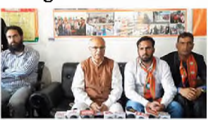
He said that a committee has been framed and soon all the daily wagers will be included in minimum wages act and they will get a good amount.